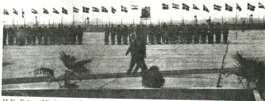
H.E. Prime Minister of Denmark, Poul Schluter upon his arrival at Palam Airport.

Upon their arrival in Bombay, Prime Minister Schluter met with the